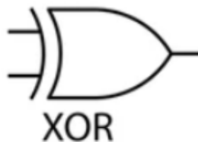
Fig.4 XOR gate symbol

The XOR gate is symbolized by a circle with a plus sign (+) inside, as shown in the following figure: