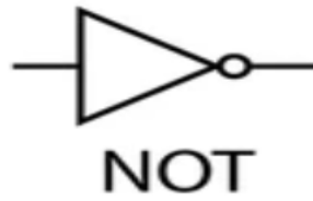
Fig. 3. NOT gate symbol

The NOT gate is symbolized by a triangle with a horizontal line ( ~ ) inside, as shown in the following figure: